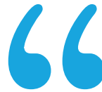
Joshua Iskander Kindergarten